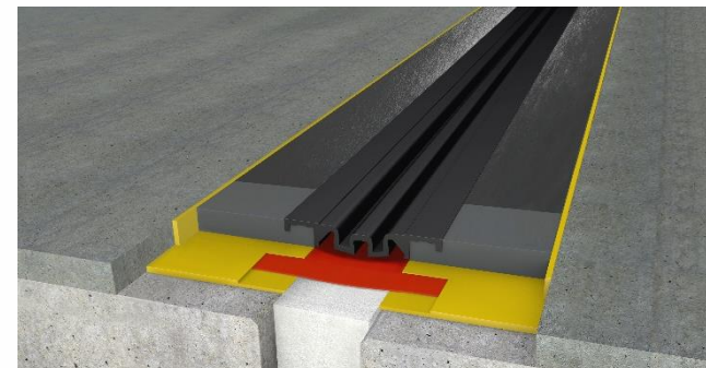
CPS 20/80 Mono