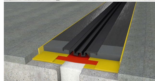
CPS Mono 20/80